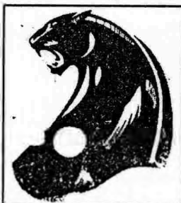
This was the logo of the United States Football League's Michigan Panthers (1983).

You said you also collect helmet decals. Do you have some of the ones we're seeing every Sunday in the NFL's 75th anniversary throwback games? I have several old AFL helmet decals, including the "red" buffalo of the Bills and the Cincinnati decal that reads "Bengals." Recently I picked up a prototype 49er helmet decal that was proposed a few years ago but was never adopted, and I also have complete sets of USFL and WFL helmet decals.